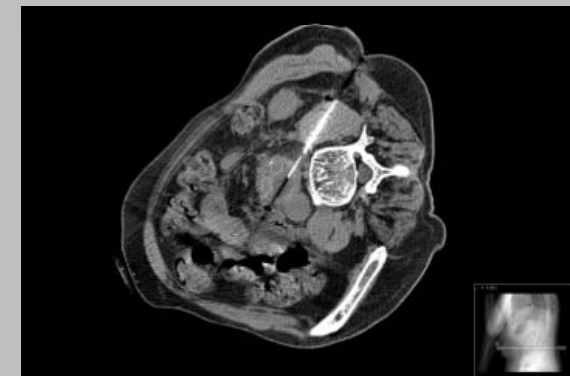
Control CT scan after needle insertion