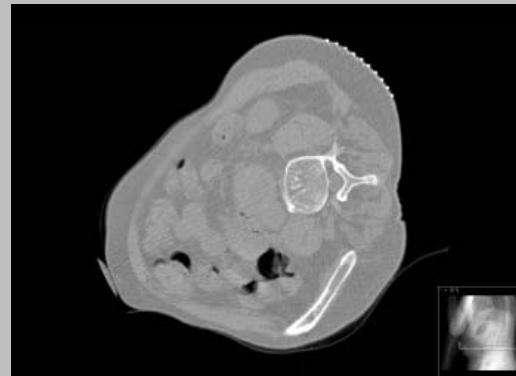
Pre-procedure CT scan